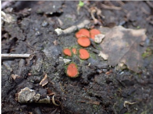
Scutellinia scutellata/Common Eyelash