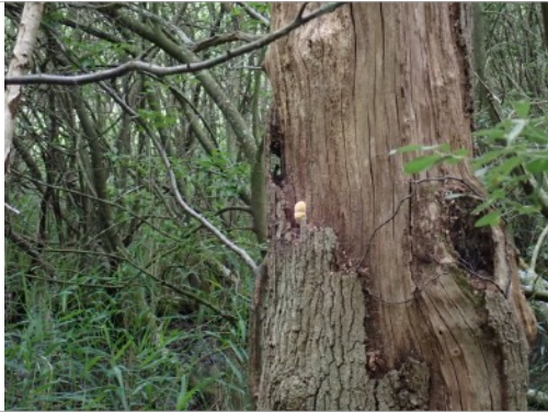
Laetiporus sulphureus /Chicken of the Woods