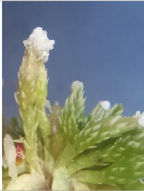
Sphagnum Moss with "fungus"