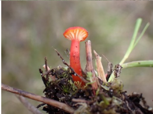
Hygrocybe coccineocrenata /Bog Waxcap