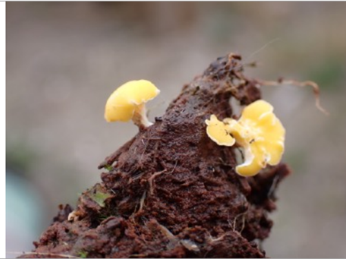
Cudoniella clavus /Spring Pin