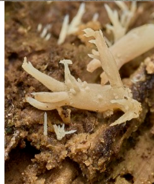
Clavulina coralloides /Crested Coral