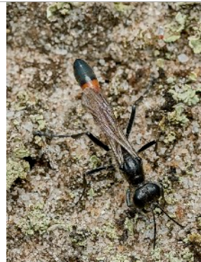
Hairy Sand Wasp